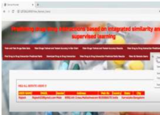
Fig.3. User details.