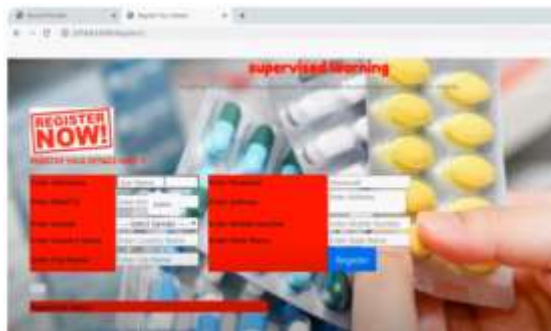
Fig.4. New user registration.