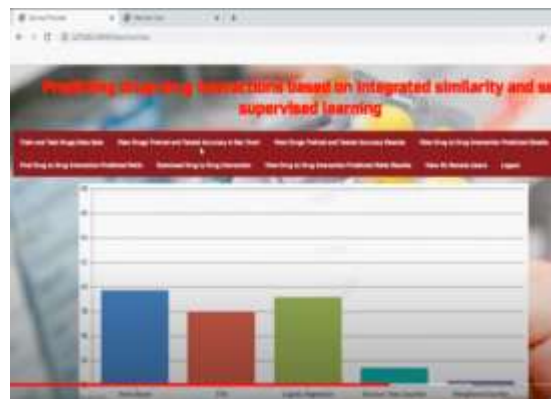
Fig.7. Output graphs.