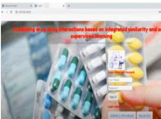
Fig.5. Sign in details.