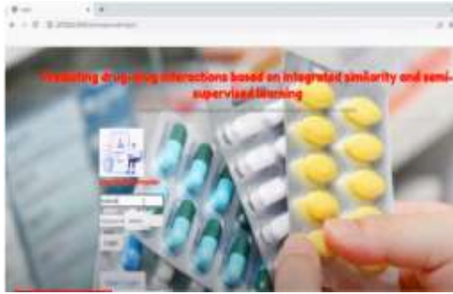
Fig.2. Admin page.