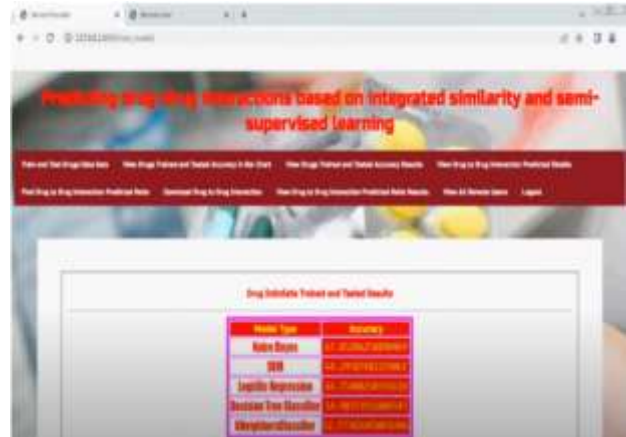
Fig.6. Output graphs.