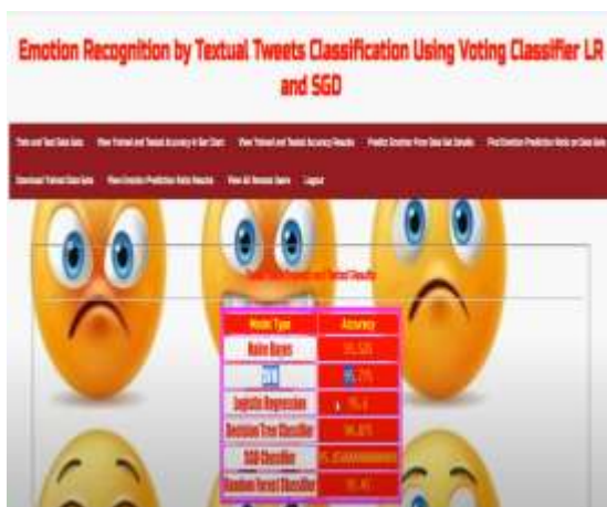
Fig.5. Output graphs with different algorithms.