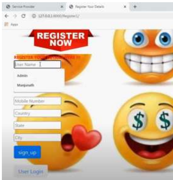
Fig.3. Registration page.