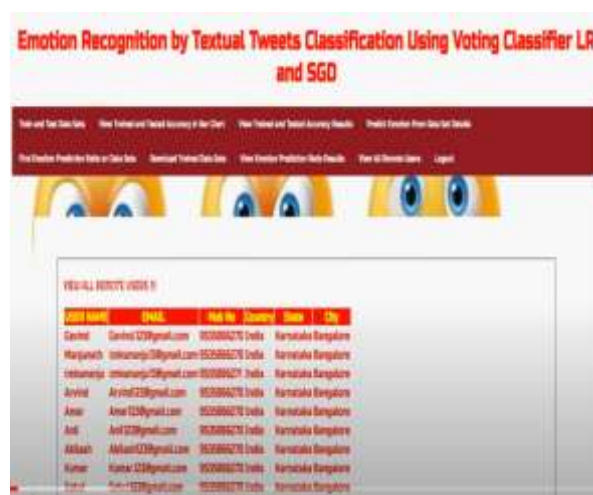
Fig.2. user details login page.