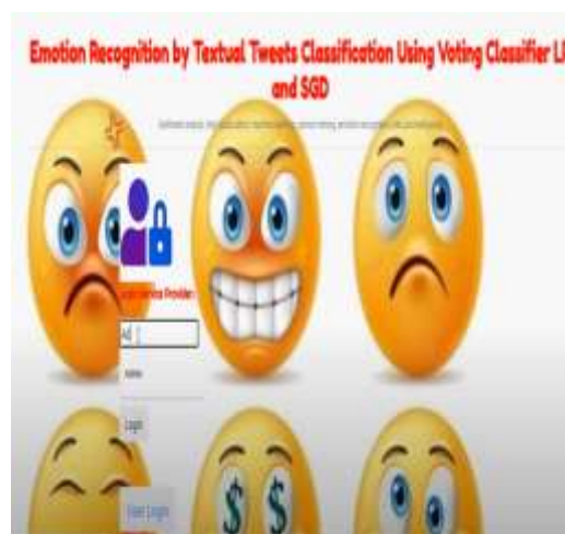
Fig.1. Home page.

check in earlier than they'll do any operations. It is viable to add a person's statistics to the database after they sign in. After efficiently registering, he'll need to log in the use of the call and password of the prison man or woman. Once logged in, users may also do things like see profiles, search for and expect emotions, post tweet records units, and register and login.