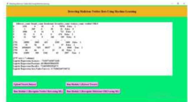
Fig.8: Malicious bot users