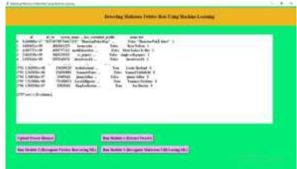
Fig.5: Displaying tweets