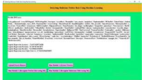
Fig.6: Possible bot users