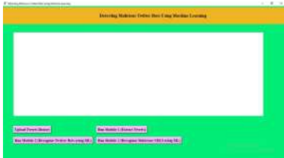
Fig.2: Home screen