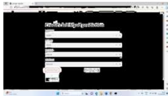
Figure 3: Output Screen of Detected as not the fraud transaction