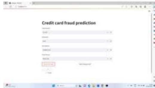
Figure 2: Output Screen of Detected as the fraud transaction