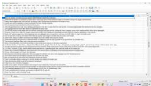
Fig 2:Data Set Values