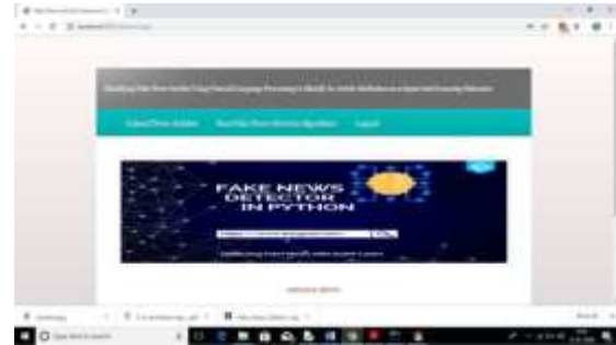
Fig 3:In above screen click on ‘Upload News Articles’ link to upload news document