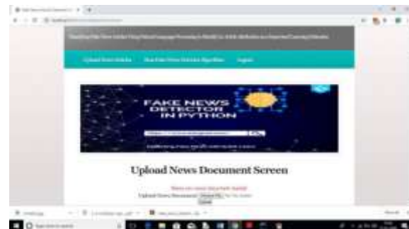
Fig 5:In above screen news file uploaded successfully, now click on ‘Run Fake News Detector Algorithm’ link to calculate Fake News Detection algorithm score and based on score and naïve bayes algorithm we will get result