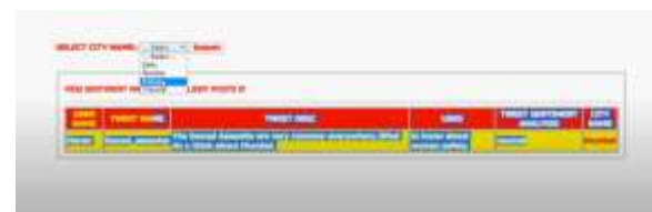
Figure 7 SENTIMENT ANALYSIS ON TWEETS ACCORDING TO GEOLOCATION