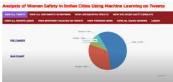
Figure 3 PIE GRAPH