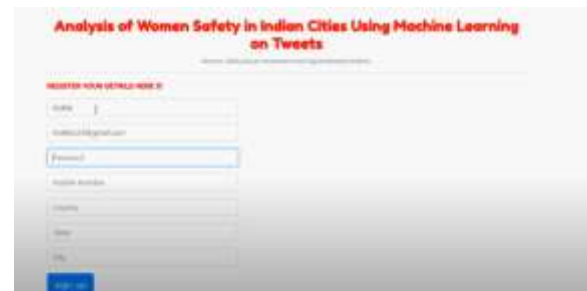
Figure 5 USER REGISTRATION