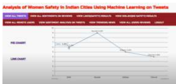
Figure 2 ADMIN LOGIN ANALYSIS