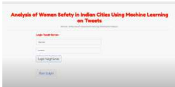
Figure 1 LOGIN SCREEN