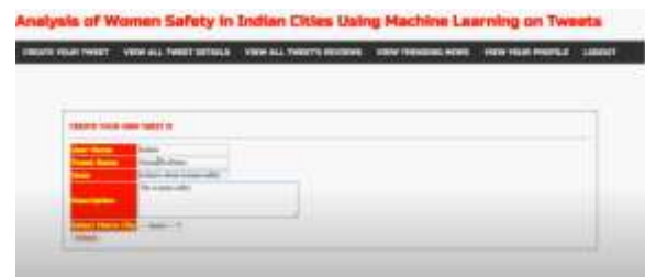
Figure 6 USER TWEET