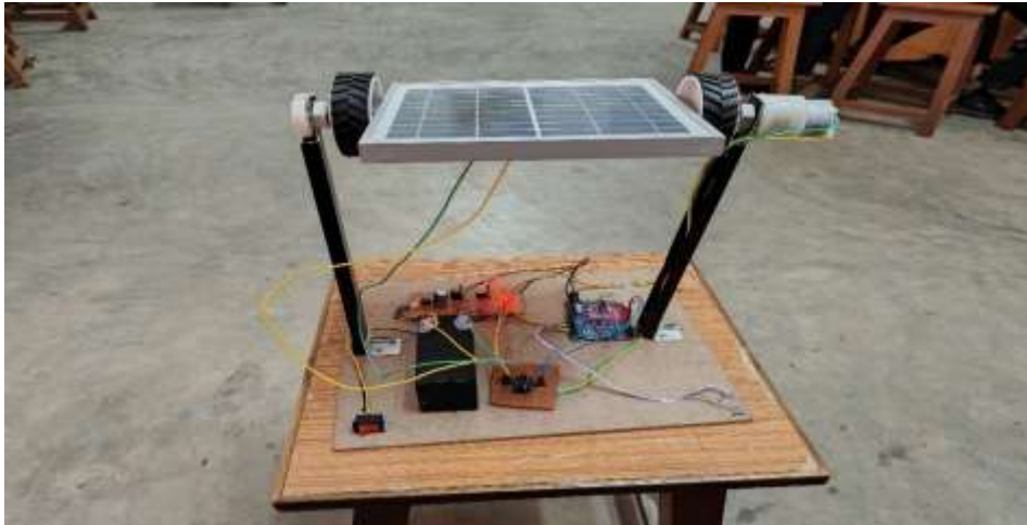
Figure.3 Working Kit