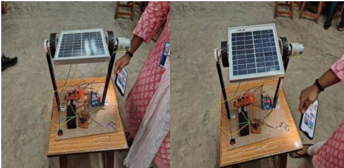
Figure.4 Real time analysis